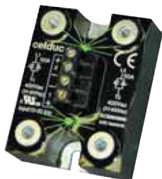
All our SCB products are now available with LED

This two phase range provides two solid state relays in a compact standard 45 mm enclosure. They are perfectly adapted to three phase applications with breaking of two phases only.