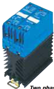
Two phase SIB 45 mm